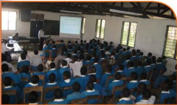
Undugu Mentors takes Students from Shimbo Secondary School through a Mentorship Session.