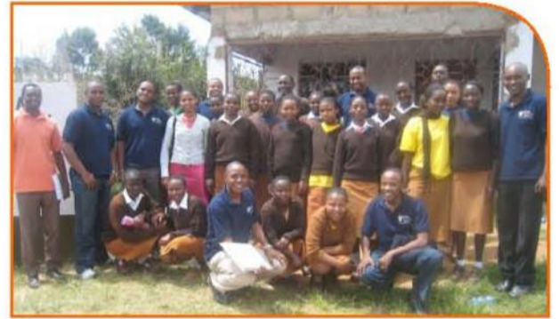
Undugu Mentors with students from Kiwinda Secondary School after a Mentorship Session