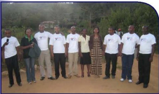
Undugu Mentors Volunteers