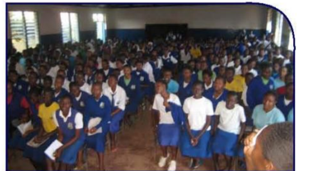
Students from Snr Chief Mwangeka Girls gathered for the program