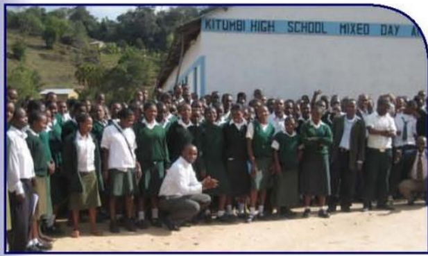
Undugu Mentors after a mentorship session with Kitumbi High School students -Taita- Feb 6th 2010